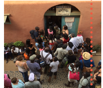
Maison des Esclaves, Senegal