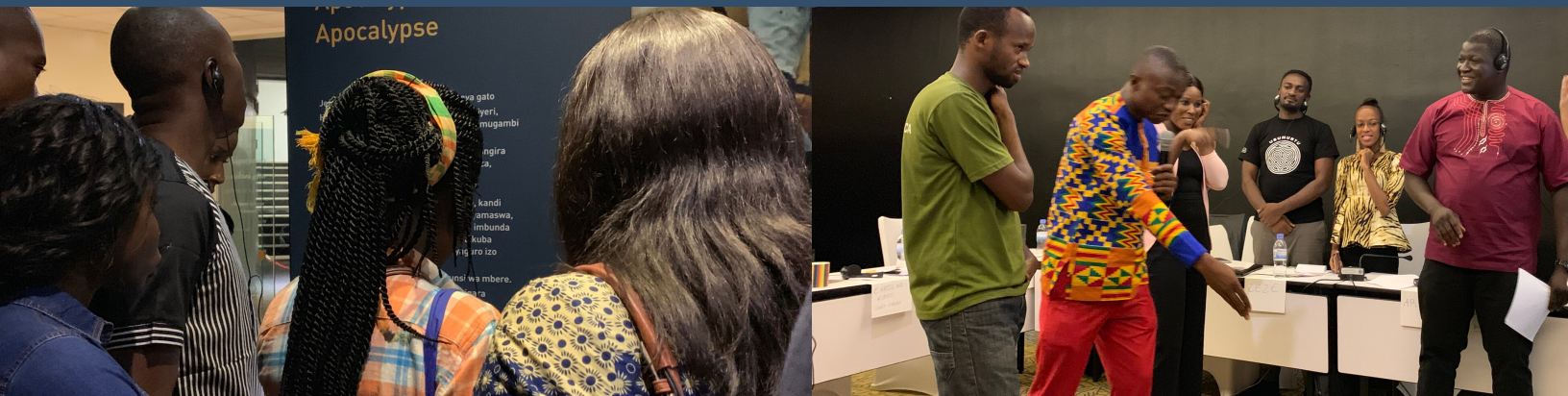
Participants visit the Kigali Genocide Memorial (left) and interact during a participatory methodologies training (right)