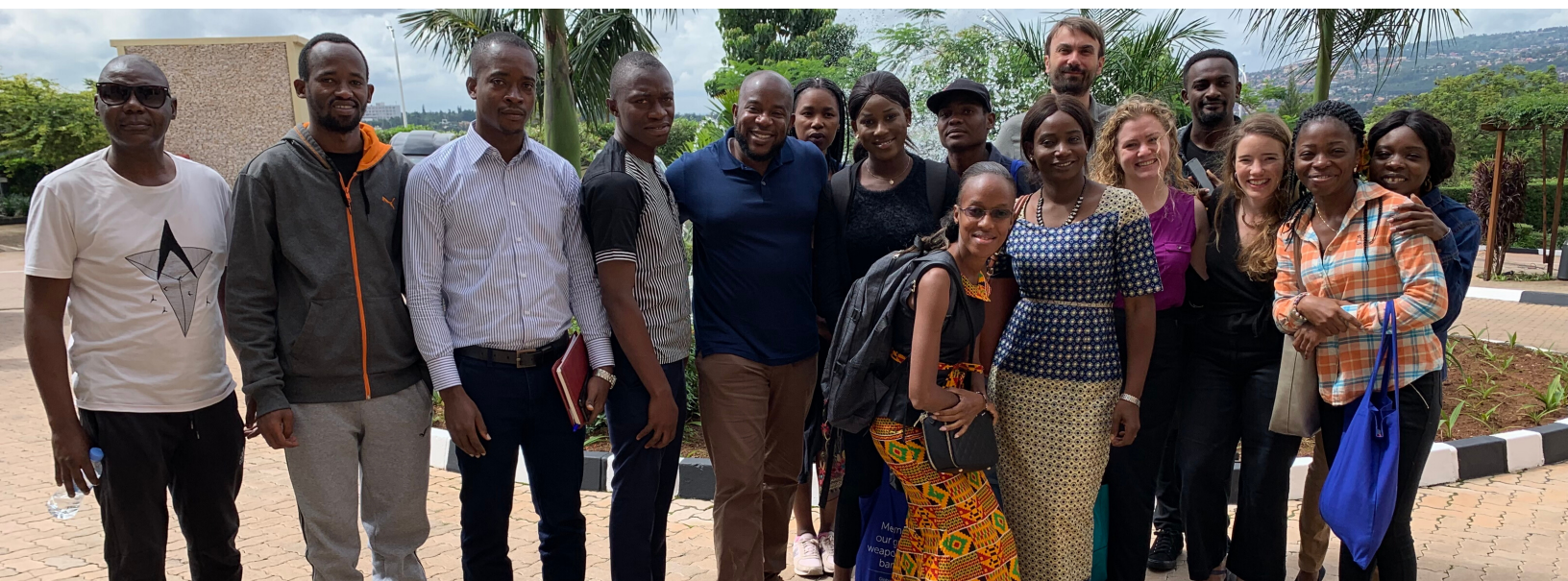
African Youth Transitional Justice Academy participants and facilitators, Kigali, May 2019

The ten young activists who made up the Academy's participants came from Mali, Cote d'Ivoire, Guinea, South Africa, The Gambia, South Sudan and Rwanda and were selected as part of a competitive application process. The GIJTR hosted two trainings for the group, the first of which focused on providing attendees with a broad foundational knowledge of transitional justice mechanisms, while the second offered participants training in using participatory methods involving the arts, culture, education, community dialogue and media to address transitional justice needs. Simultaneously, the Academy aimed to provide participants with opportunities for networking and sharing experiences and expertise across diverse African contexts. As part of this effort, GIJTR supported the participants to engage in cross-regional collaboration and, working in pairs, to develop small projects to address issues related to justice, truth and reconciliation in their communities with financial and technical support from the Consortium partners. These subgrants allowed the participants to put into practice the lessons and ideas they exchanged throughout the Academy trainings and to pilot new initiatives when they returned home. The following report highlights the results of the participants' projects—all innovative programs launched and implemented by young activists with an eye toward engaging youth on key transitional justice issues.