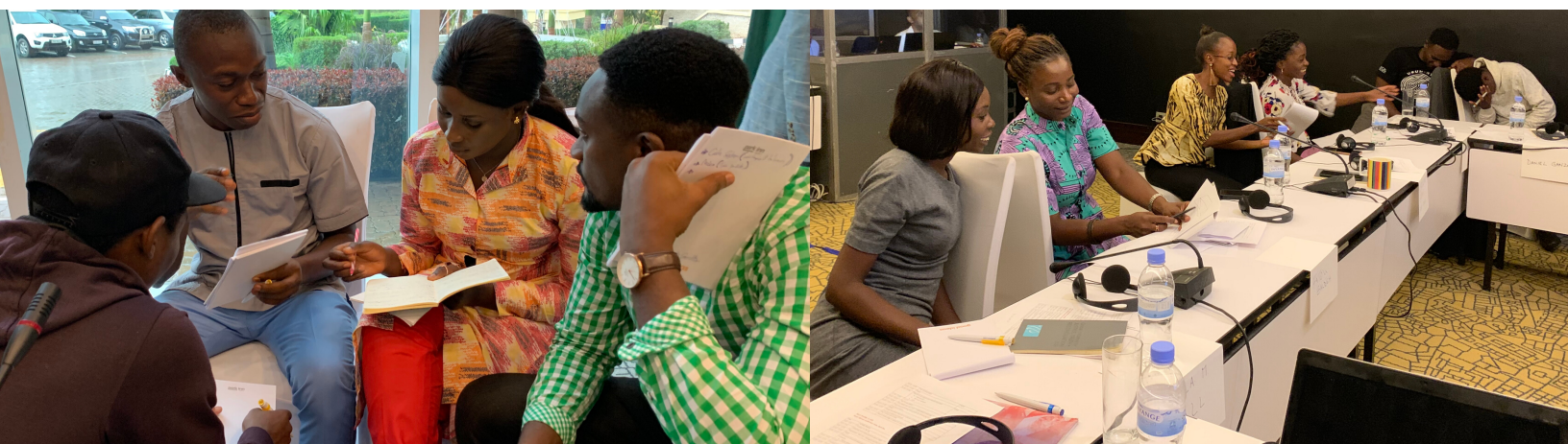
Participants join group discussions and exercises at African Youth Transitional Justice Academy workshops in Kigali, May & July 2019

"Cherish and make good use of the powerful behavioral change and healing stories... If we can document, create a platform and spaces for people to watch these stories and engage in self-reflection discussions, then we will discover the power of stories as a peace building tool." - Daniel Ganza