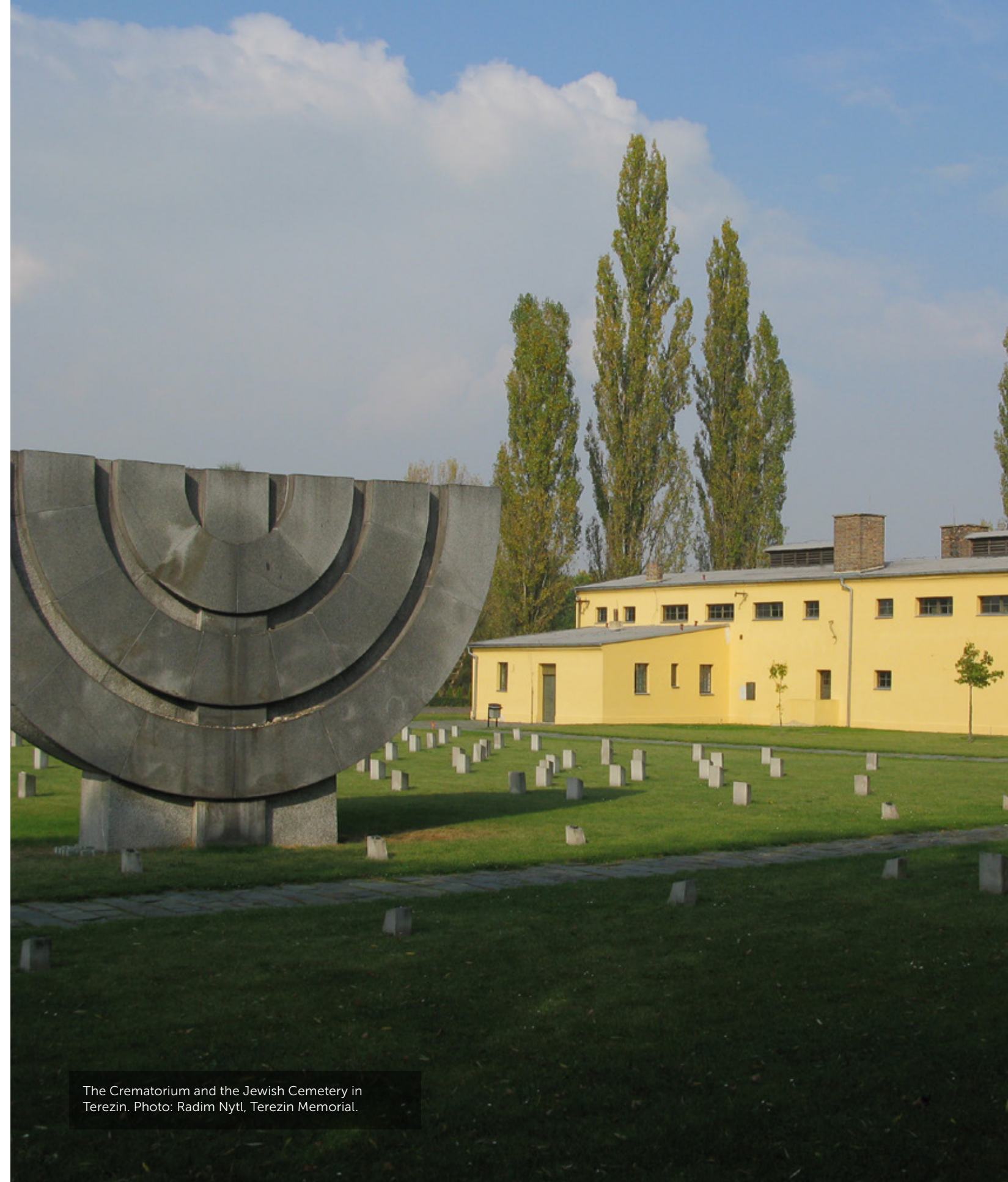
The Crematorium and the Jewish Cemetery in Terezin.