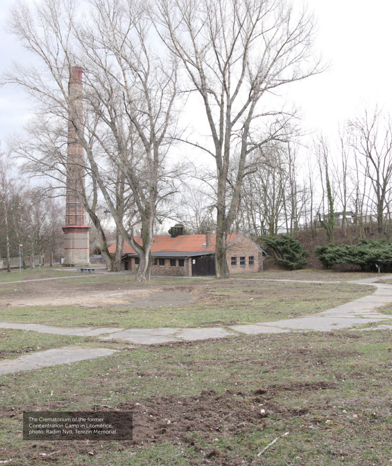
The Crematorium of the former Concentration Camp in Litoměřice, photo: Radim Nytl, Terezin Memorial.