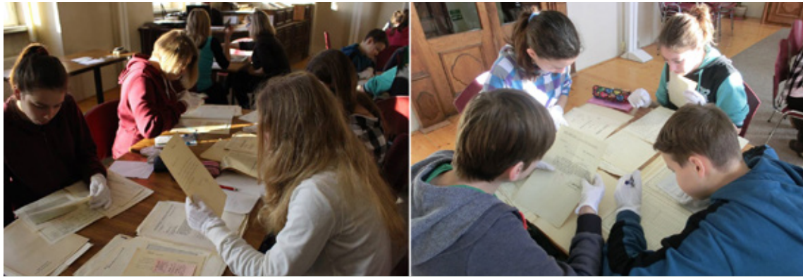
Visit and study at the archive, pupils from the Milovice Primary school team. Archive in Nymburk, the Czech Republic (1, 2)