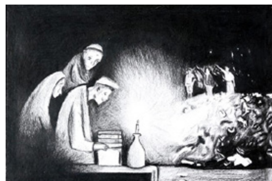
Eliška Váralová, 17 years, from Olomouc, 3rd category, 2nd place, without name