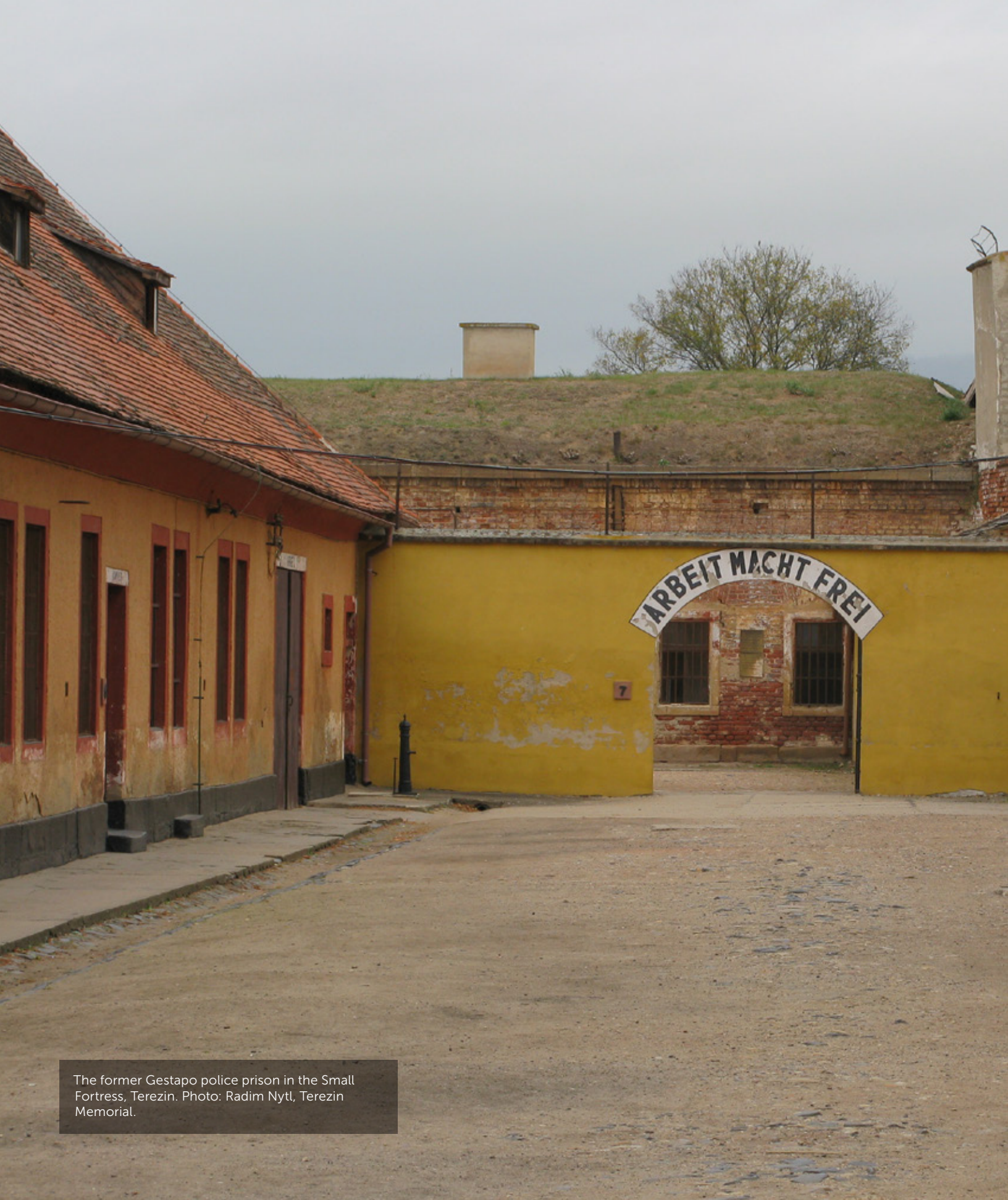
The former Gestapo police prison in the Small Fortress, Terezin.