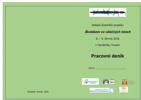
Front page of the working diary