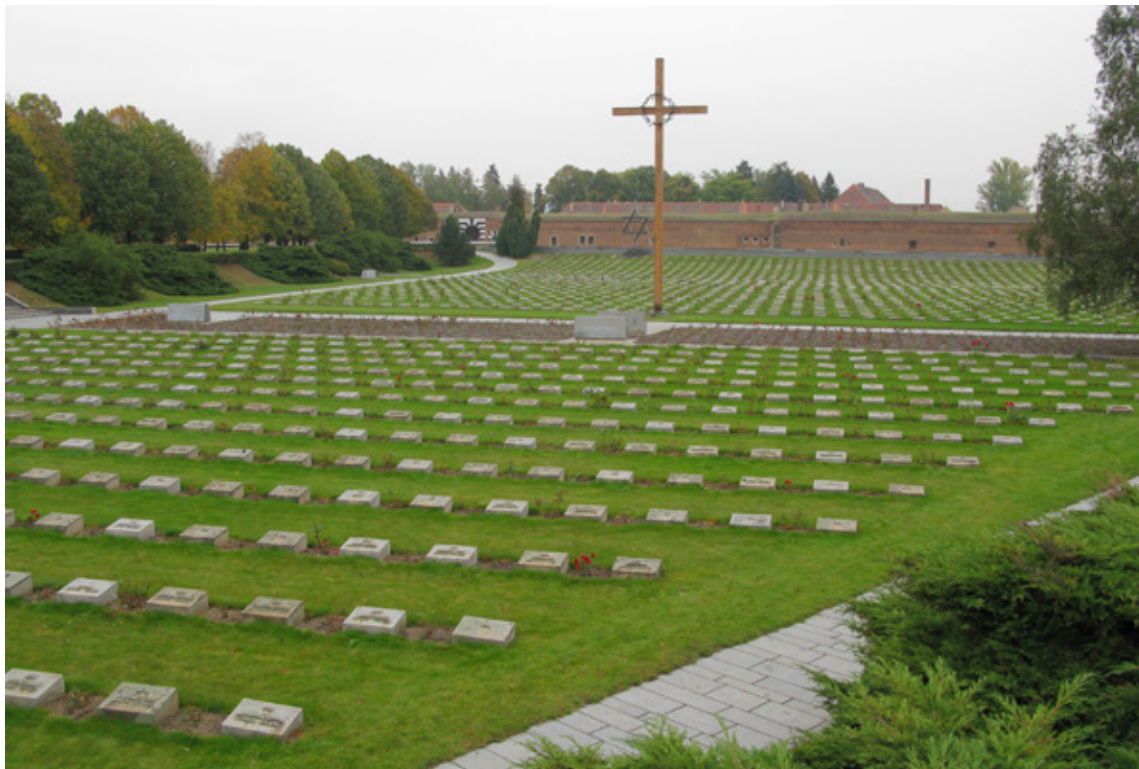
The National Cemetery at the Small Fortress, Terezin

One of the icebreakers used was "Bingo." Each participant was given a sheet of paper with 20 tasks of the following type: Find somebody who is fond of walking in the woods! Find somebody who is keen on extreme sports! Find somebody who learns English/German!... Participants (both youth and teachers) spent 20 minutes of the meeting moving freely in the room and getting to know the other participants.