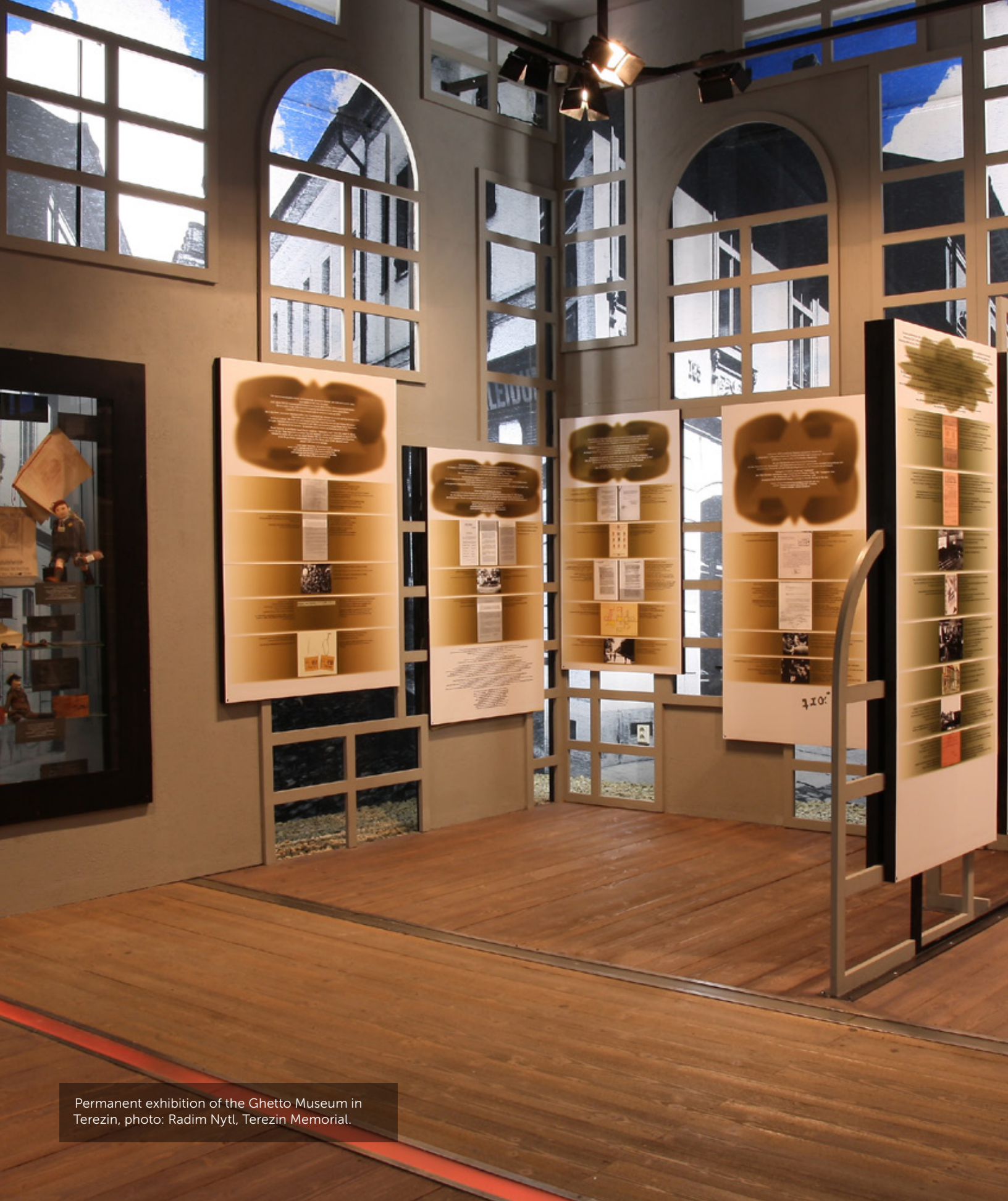
Permanent exhibition of the Ghetto Museum in Terezin, photo: Radim Nytl, Terezin Memorial.