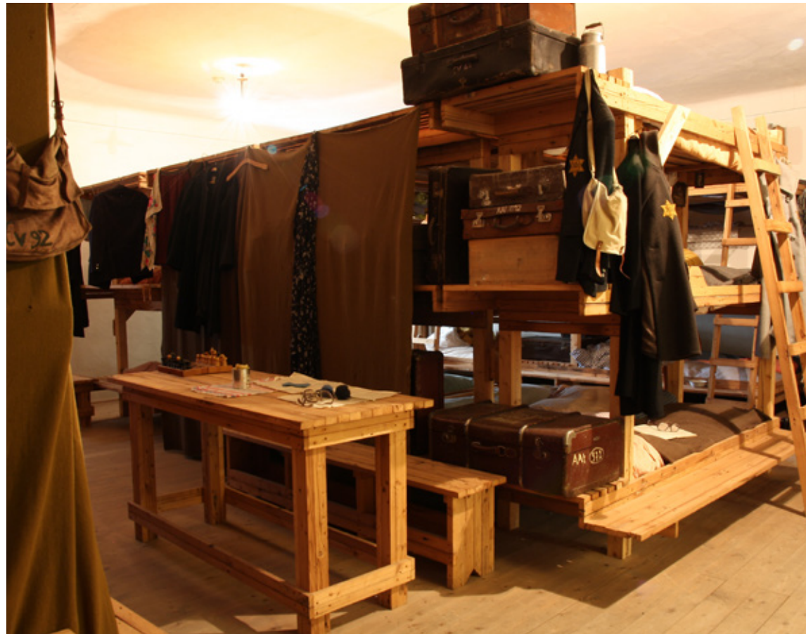
The replica of the dormitory from the former Terezin Ghetto, permanent exhibition in the former Magdeburg Barracks, Terezin Memorial, photo: Radim Nytl, Terezin Memorial.

The ran from January 2016 through December 2016. In that time the initial steps of project creation were completed, but many of the activities are continuing (especially exhibitions and presentations). In the future, other teams and individuals are expected to gradually join the project, and follow a similar work pattern to the project's first 2016 wave. The future outputs of the project may vary as they do not all have to produce an exhibition.