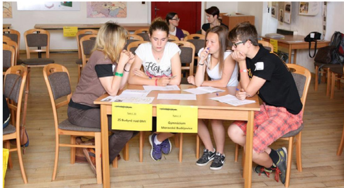
One of the workshops at the Attic of the former Magdeburg Barracks, Terezin Memorial

The second workshop for youth reflected the whole area of Terezín, the site of two Nazi repressive facilities in the past. The purpose of this workshop was also focused on gaining new information for the participants.