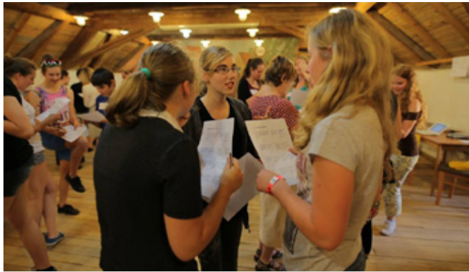
"Bingo" ice-breaker, the Seminar room at the former Attic theatre, Magdeburg Barracks, Terezin Memorial