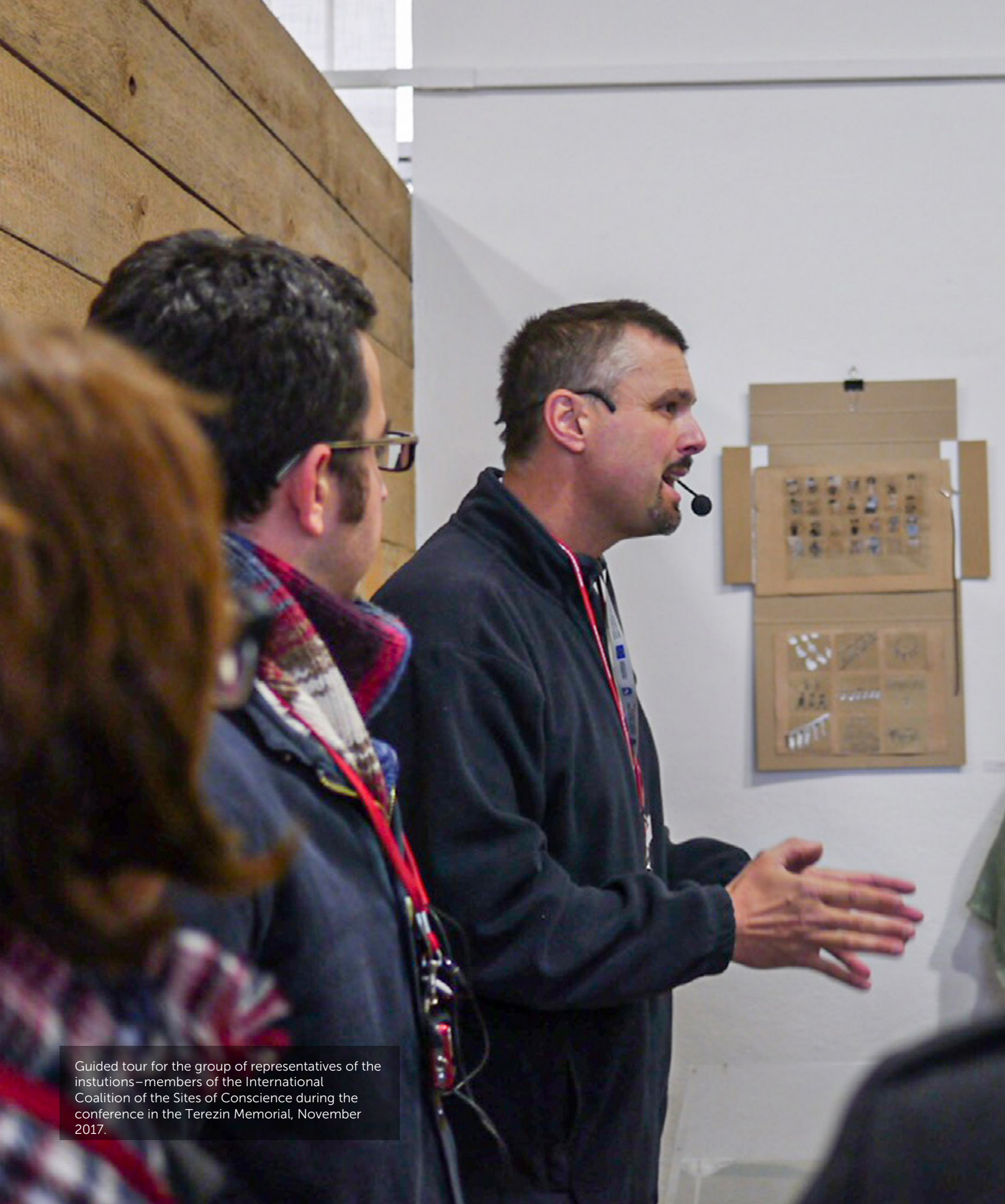
Guided tour for the group of representatives of the institutions—members of the International Coalition of the Sites of Conscience during the conference in the Terezin Memorial, November 2017.