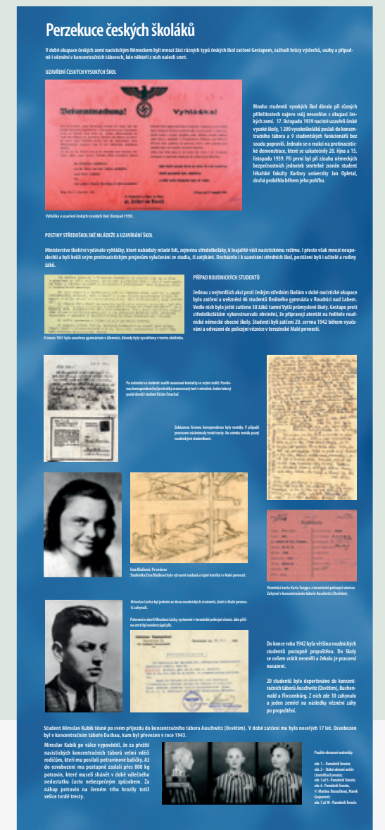
One of the roll-ups for the exhibition – "Persecution of Czech schoolchildren"

These ten panels contain basic information covering the issues of schooling and schools in the Czech lands in the given period.