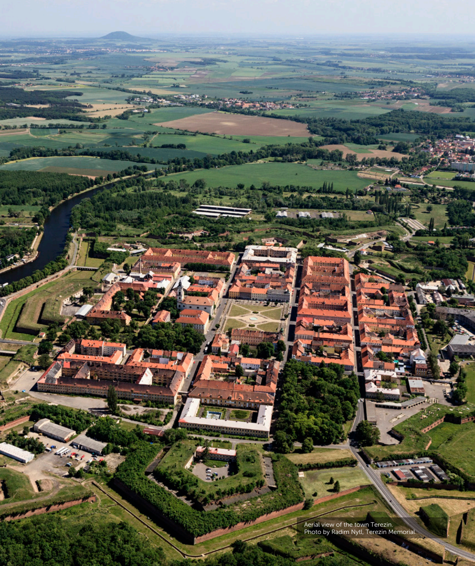
Aerial view of the town Terezin.