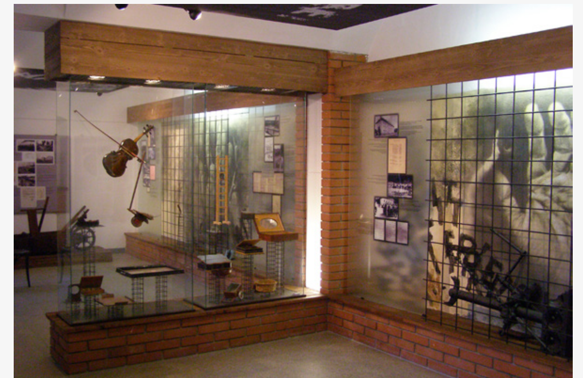
The permanent exhibition of the Museum of the former Gestapo Police Prison in the Small Fortress in Terezín, photo: Radim Nytl, Terezín Memorial.

Students: Carry out research and design exhibition panels.