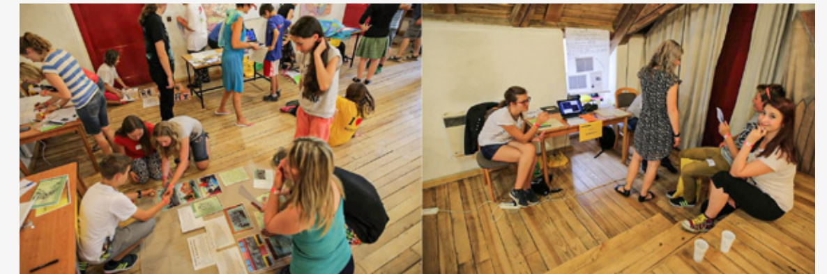
Preparatory phase for the „Market” of the team’s research work, the Seminar room at the former Attic theatre of the former Magdeburg Barracks, Terezín Memorial

During the preparations for the marketplace the room was completely changed. The tables were covered with leaflets, photographs, copies of documents, there were posters hanging from the rafters behind the tables, and laptops with video presentations appeared on the tables. The demand on the participants was quite challenging but the outcome was amazing. Each team succeeded in presenting its research findings, explaining their displayed pictures and documents, adding stories from the project development, and stressing the most important lesson learned from their research. Students spoke about their projects with great erudition.