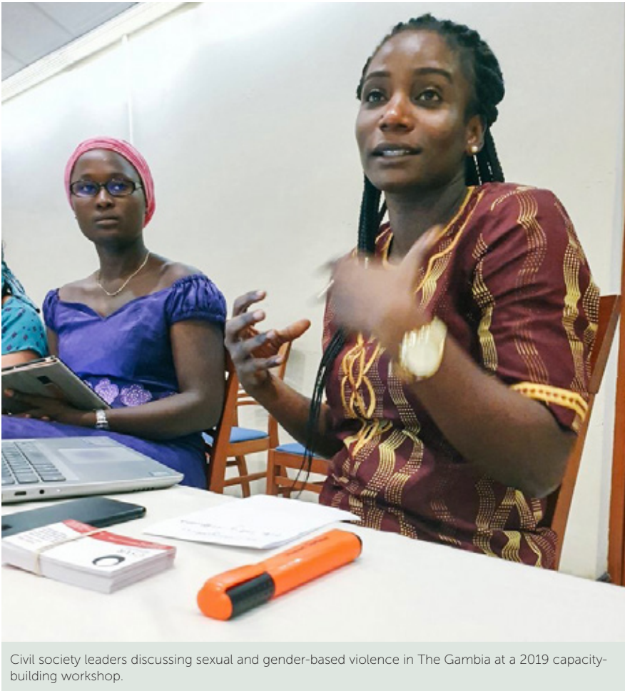
Civil society leaders discussing sexual and gender-based violence in The Gambia at a 2019 capacity-building workshop.

driven by – a capacity-building component for local CSO partners. This should not be limited to transferring technical expertise, but should include an organizational development component that contributes to their sustainability, including, for example, supporting access to independent fundraising.