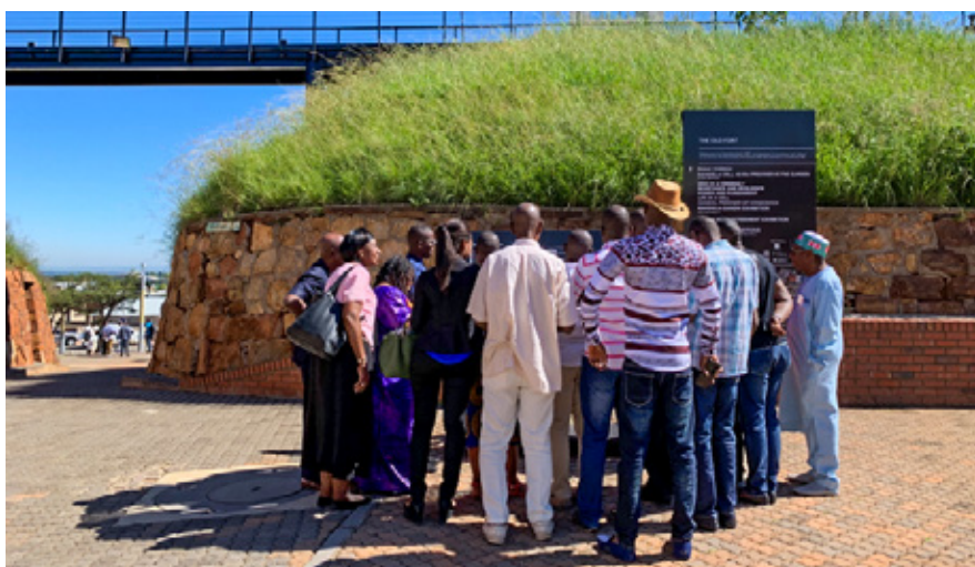
A February 2019 exchange in Johannesburg, South Africa with civil society representatives from Guinea discussing regional approaches and challenges to transitional justice with activists in South Africa.

The justice cascade, however, is an apt metaphor for the inherent top-down approach to much of transitional justice, both formal state-led processes and the role of civil society generally. In practice there are multiple “civil societies,” but often actors in the global North partner with and/or fund national civil society, which is based in the capitals of states in transition, and may or may not have relationships with local/regional civil society, which has deep roots in communities. These latter structures are often spontaneous collectivities rooted in solidarity and mutual support between victims and community members but divorced from both discourses of transitional justice and its global funding and support. What has been called the “local-local” 4 represents an articulation