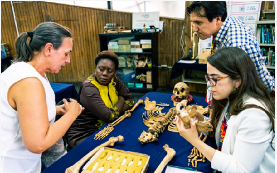
Human Identification Training by the Forensic Anthropology Foundation of Guatemala in Guatemala.