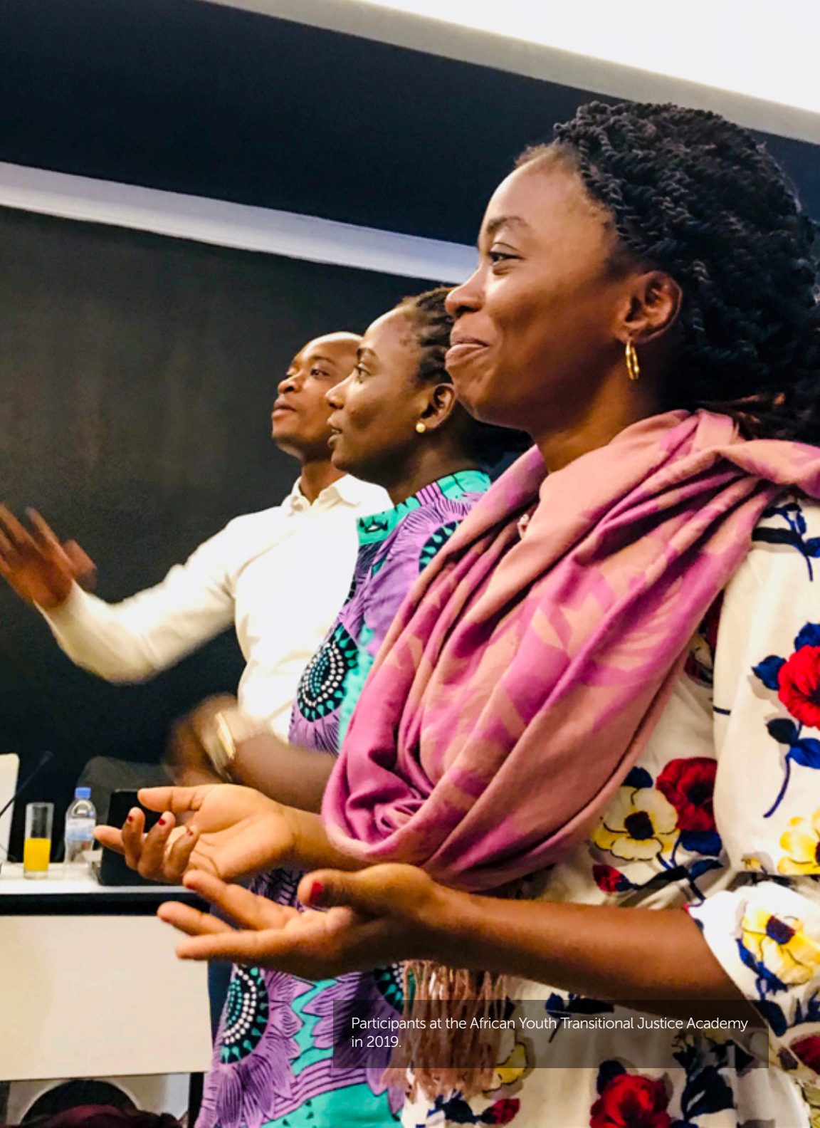
Participants at the African Youth Transitional Justice Academy in 2019.