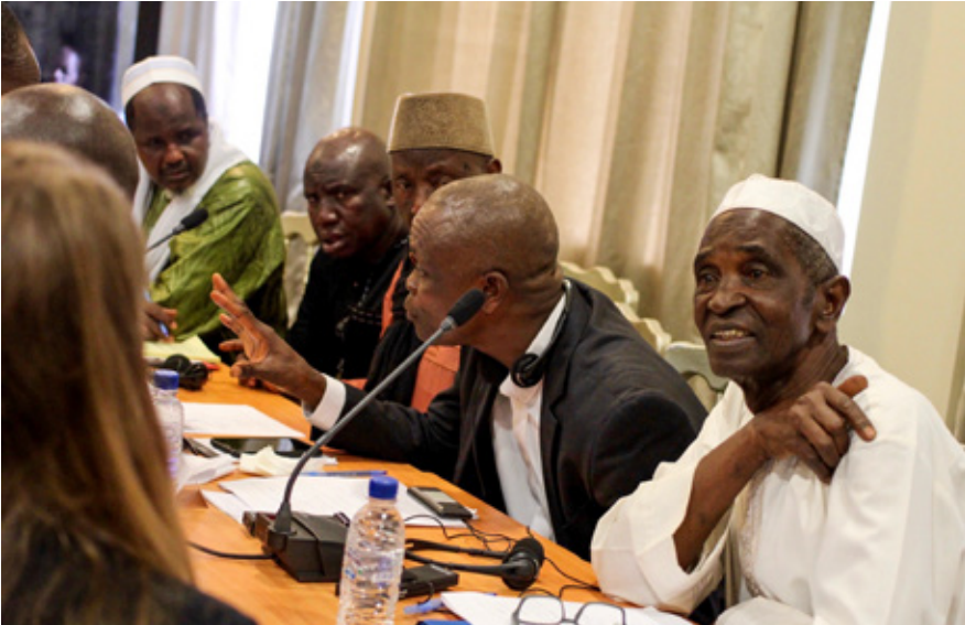
Representatives from civil society organizations planning activities and workshops in Conakry, Guinea.

and South Africa were particularly helpful and inspiring for precisely this reason. Localizing approaches to justice demands the incorporation of traditional African healing models, ideologies and cosmologies into the Western models of mental health and psychosocial support that international projects bring. There is otherwise the possibility that even the idioms of distress that communities demonstrate are not acknowledged as indicative both of trauma and of a demand for a contextualized approach to addressing it. This is a question of sustainability, relevance and simple efficacy.