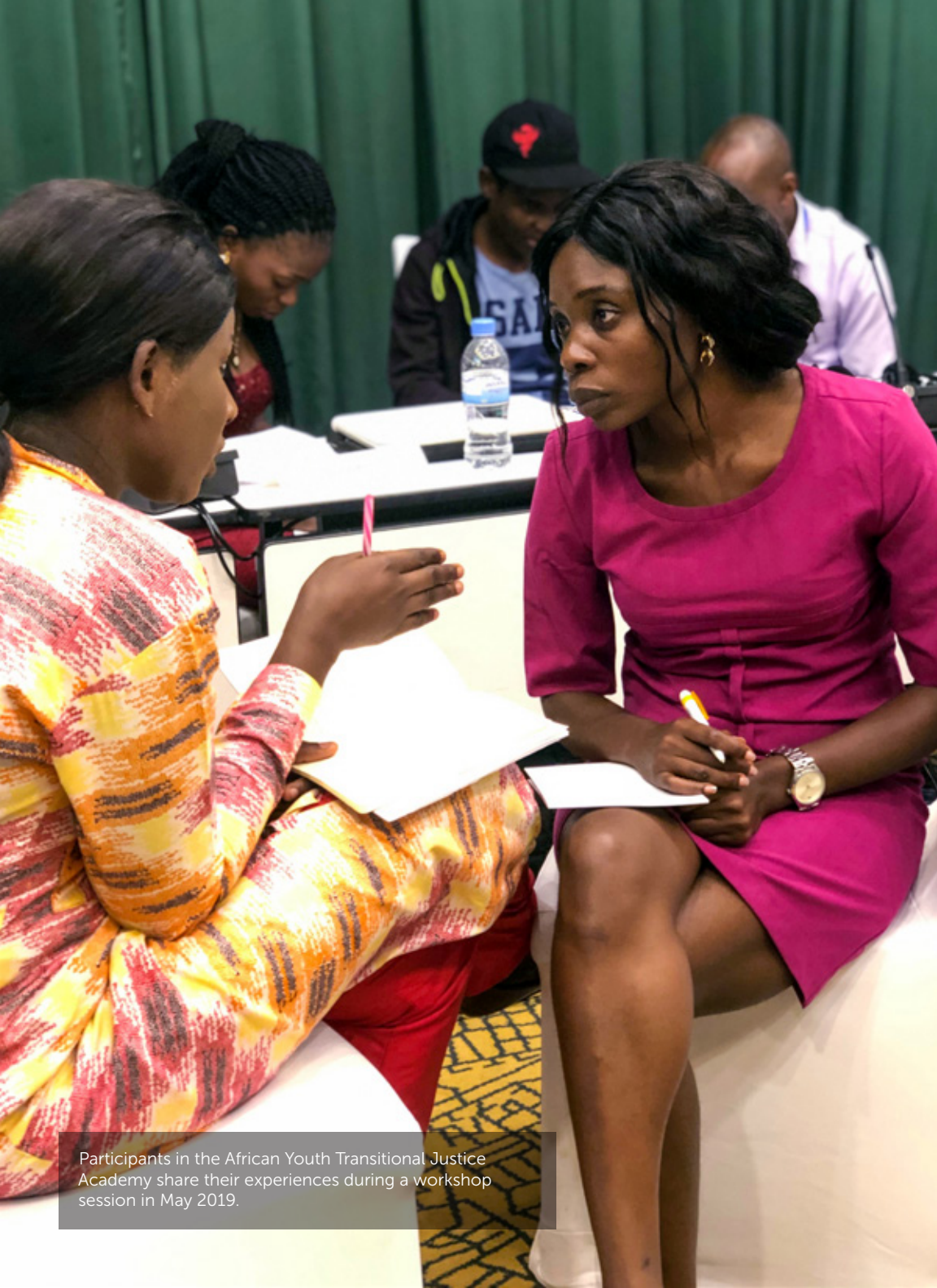
Participants in the African Youth Transitional Justice Academy share their experiences during a workshop session in May 2019.