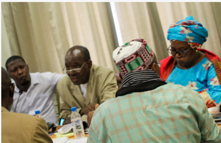
Collaborative, multi-disciplinary planning between various facets of civil society organizations in Conakry, Guinea.

The use of workshops to both enhance awareness of particular issues and build concrete capacities is a longstanding tradition in transitional justice. GIJTR's work in Guinea has, however, emphasized the importance of ensuring that those delivering training contextualize it. In the Guinea case this involved using the expertise of both local actors alongside those from other African contexts. Prioritizing those from the region rather than from the Global North is a crucial part of seeking to localize approaches taken to addressing issues of justice and seeing any process as a response to local needs, rather than the imposition of a global template. In the participatory methodologies training, participants noted that the experiences shared by ICSC's member sites from Kenya