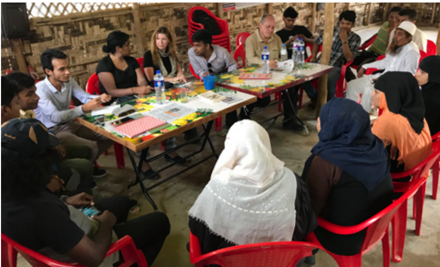
Community consultations with Rohingya Muslim communities in refugee camps in Bangladesh in 2019.

In 2017, the International Coalition of Sites of Conscience (ICSC) held a training on designing and implementing community-level facilitated dialogue for ten South Sudanese civil society activists and community workers, both men and women. In divided settings around the world, ICSC uses a facilitated dialogue methodology as a tool to encourage communication among individuals with varied experiences and often differing perspectives to engage in an open-ended conversation toward