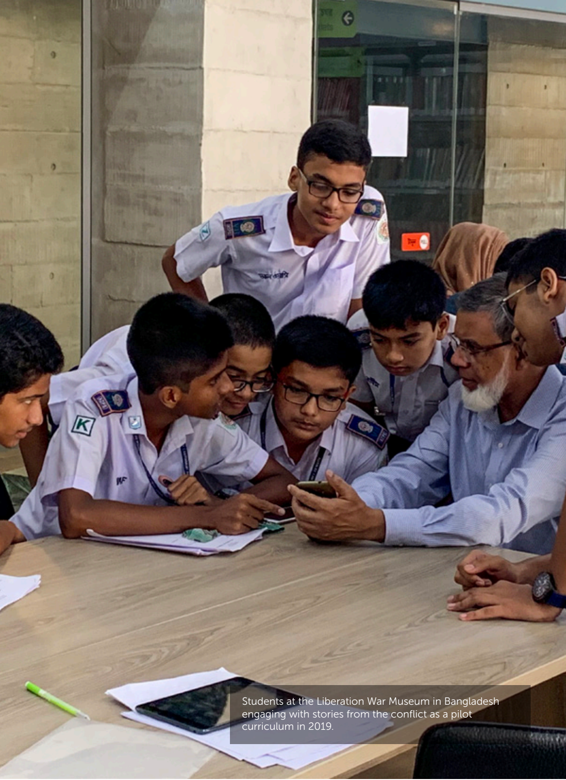
Students at the Liberation War Museum in Bangladesh engaging with stories from the conflict as a pilot curriculum in 2019.