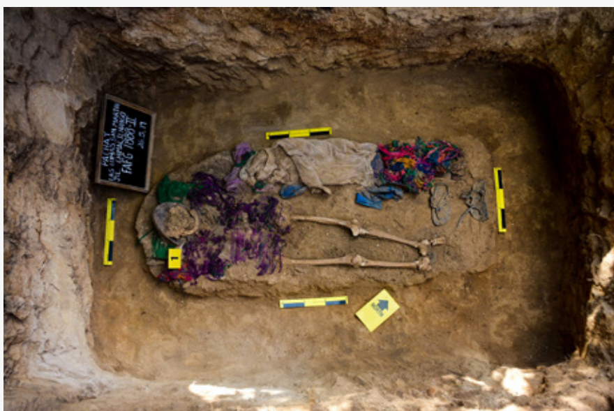
Exhumation of human remains in Chimaltenango, Guatemala.

Additionally, the current political climate in Guatemala, which impacts the transitional justice process, was introduced. Participants learned how