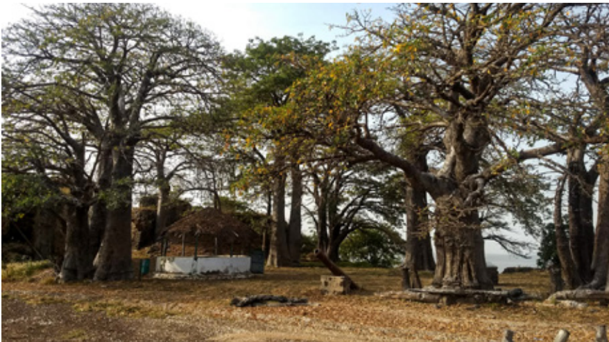
A visit to Kunta Kinteh Island in The Gambia, which became a key stronghold to the propagation and eventual termination of the transatlantic slave trade in 1807.

Holistic and Context-specific Approach to Transitional Justice: In an effort to counter the widespread notion that “transitional justice is no more or less than the TRRC”, the Consortium designed its transitional justice training with the aim of analyzing the Gambian context through the lens of all transitional justice pillars and possible mechanisms. The consultative mission at the beginning of the project revealed that international NGOs have conducted multiple transitional justice trainings with Gambian civil society, mostly one-off formulaic presentations of transitional justice and its four pillars (truth, justice, reparations and guarantees of non-repetition), and that CSOs still lacked understanding of how those pillars and mechanisms could be applied to the Gambian