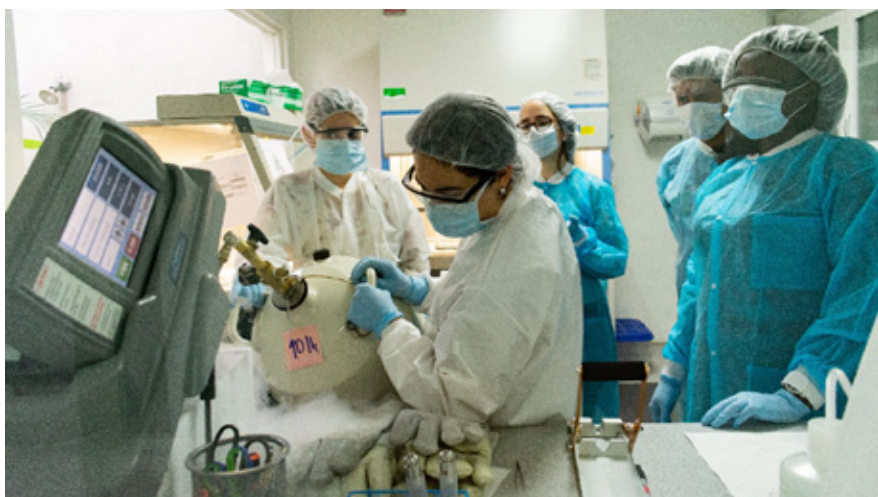
Forensic processing and lab introduction as part of the Forensic Academy.

The mission of the Forensic Academy is to build local capacity in the application of forensic sciences in the search for and identification of the missing and the disappeared. It focuses on participants from countries in the global South that are struggling with unaddressed human rights violations or that are currently implementing transitional justice processes. Beyond forensic work, participants in the pilot Forensic Academy received training on psychosocial accompaniment and the role of memorialization in transitional justice, with the collaboration of