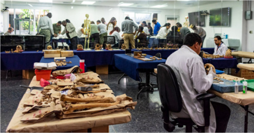
Participants learn about human anatomy during the scientific component of the training.