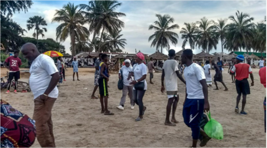
The Truth, Reconciliation and Reparations Commission in The Gambia sharing news about truth commission hearings that focus on sexual and gender-based violence in 2019.

one way or another, and so almost the entire population perceives themselves as victims. The long-anticipated reparations framework of the TRRC will be a true test of the government's ability to adopt context-specific measures that are tailored to the needs of victims and the broader population.