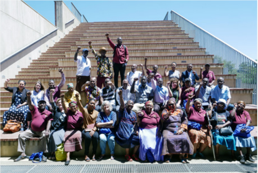
Civil society representatives from Guinea and South Africa in Johannesburg, sharing obstacles, successes and strategies for advancing transitional justice in their contexts.