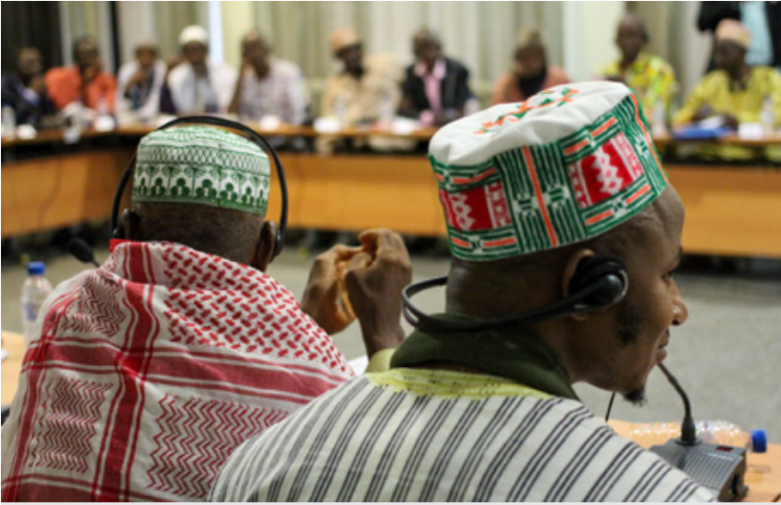
Local religious leaders at an awareness-raising session on the wide-ranging impacts of past human rights violations and their role as community leaders in promoting truth, justice and reconciliation goals.

The early successes of these two workshops were credited to multiple factors. Firstly, at the beginning of the first workshop – knowing that many of the participants had very little prior knowledge of psychosocial support – the facilitators framed their presentations to ensure that participants would gain a clear understanding of why psychosocial support is crucial to ensuring an impactful, ethical and meaningful transitional justice process, so that they would see and understand that it is an essential component of the work they are doing and hope to continue to pursue.