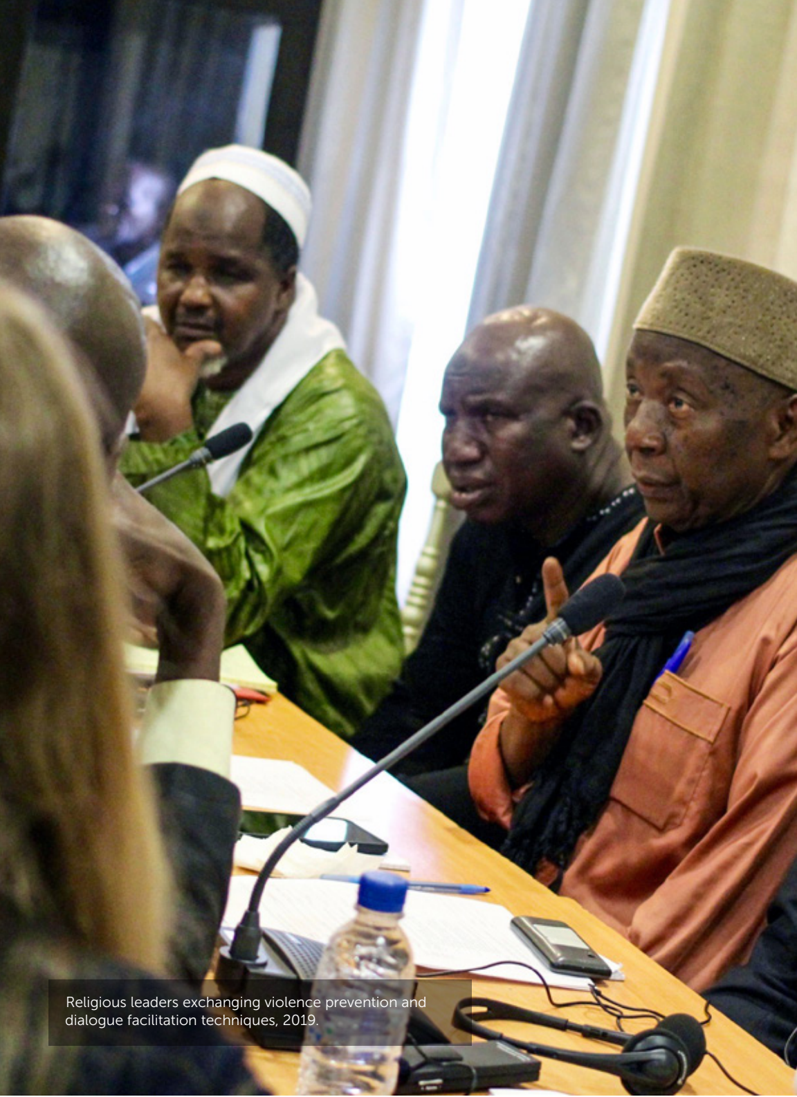
Religious leaders exchanging violence prevention and dialogue facilitation techniques, 2019.