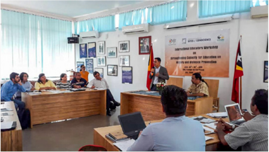
GJTR's International Educators Workshop in Timor-Leste in June 2018.