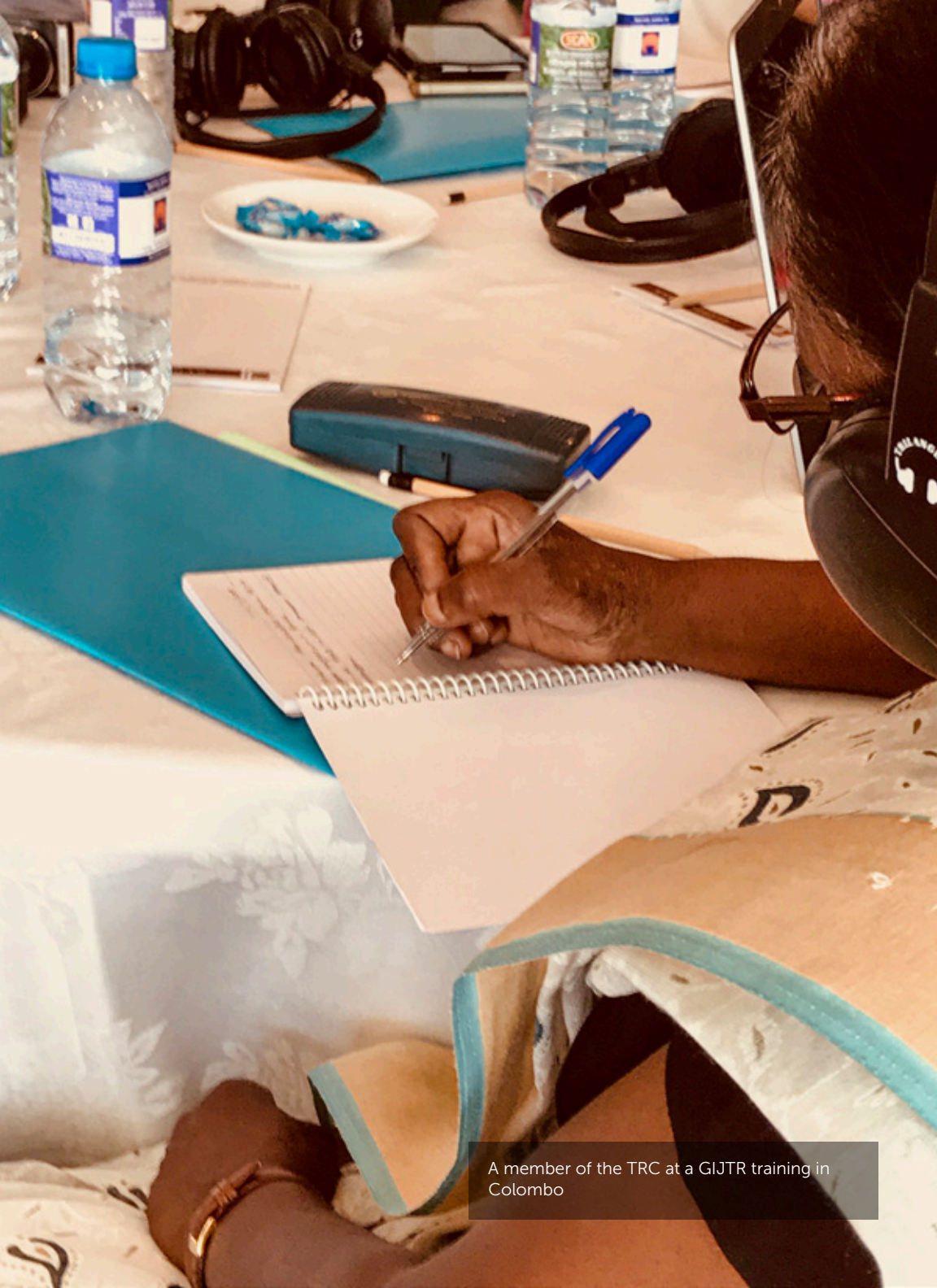
A member of the TRC at a GIJTR training in Colombo