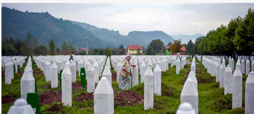
Srebrenica-Potocari Memorial Center & Cemetery in Bosnia and Herzegovina

Chapter 7 engages with the mainstreaming of gender in civil society action to address histories of violence. GIJTR partners have noted how the participation of women is often absent in formal transitional justice processes and how civil society action and interventions that unfold in