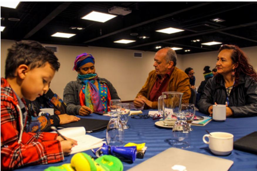
Representatives from civil society organizations in Colombia working together at a capacity-building transitional justice workshop in 2019.

Several of the pending tasks are being undertaken in phase two of the project, which includes a needs assessment on CSO documentation, capacity-building trainings and the preparation of an action plan for immediate implementation.