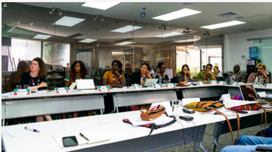
The group with representatives from 14 countries gathered to exchange practices.

FAFG's victim- and family-centered approach to forensic investigations has garnered international recognition, including invitations to share expertise broadly in Mexico, El Salvador, Colombia and Sri Lanka, and FAFG's participation in GIJTR has provided additional opportunities for sharing its experience to contribute to a global effort to address disappearances. FAFG's Guatemalan and international experience confirms that CSO representatives and family members are empowered