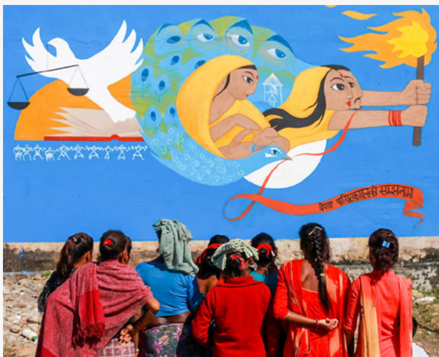
Women whose family members were disappeared during the armed conflict in Bardiya, Nepal created a mural entitled, "The search of the missing family members and the much longer search for the truth," with the support of ICSC member National Network of Families of the Disappeared and Missing in Nepal.

The other area of work with civil society in transitional justice where lessons can be learned from GIJTR's experience is how international actors can best support civil society to advance relevant and contextualized process. There has long been a tension between international actors who bring valuable resources, both technical and financial, and local civil society who are close to affected communities and know the constraints and opportunities in their context. This has sometimes been presented as external donors bringing a discourse and a prescriptive practice from the global North that can override local perspectives and approaches. Precisely because GIJTR seeks to enable and empower civil society to lead the process being supported, its work is a potential model for all international donors looking for routes to supporting contextualized transitional justice processes. This issue is discussed in the chapters of the volume and summarized and discussed in the concluding chapter.