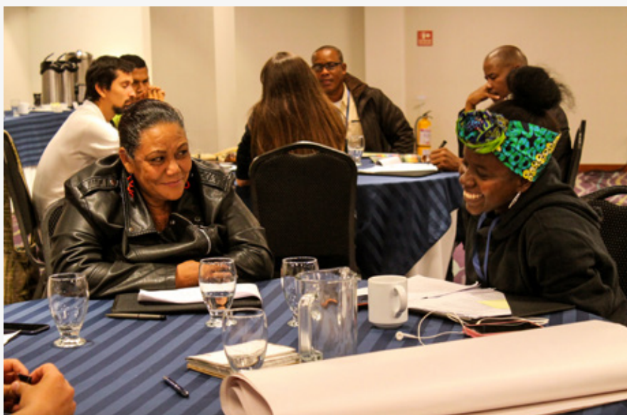
A community outreach and truth-telling workshop with members of civil society in Bogotá, Colombia in July 2019.

The second roundtable was developed in coordination with the United Nations Office of the High Commissioner for Human Rights (UN OHCHR). This built on a mapping of stakeholders conducted in 2017 by the ICSC, the Dutch Embassy, OHCHR and the Organization of American States Mission Supporting Peace in Colombia. A group of victims' organizations and CSOs with relevant documentation was selected to participate in the roundtable, with special care to include ethnic minority, regional and women's organizations, as well as the main umbrella organizations of victims. Regional CSOs participated remotely