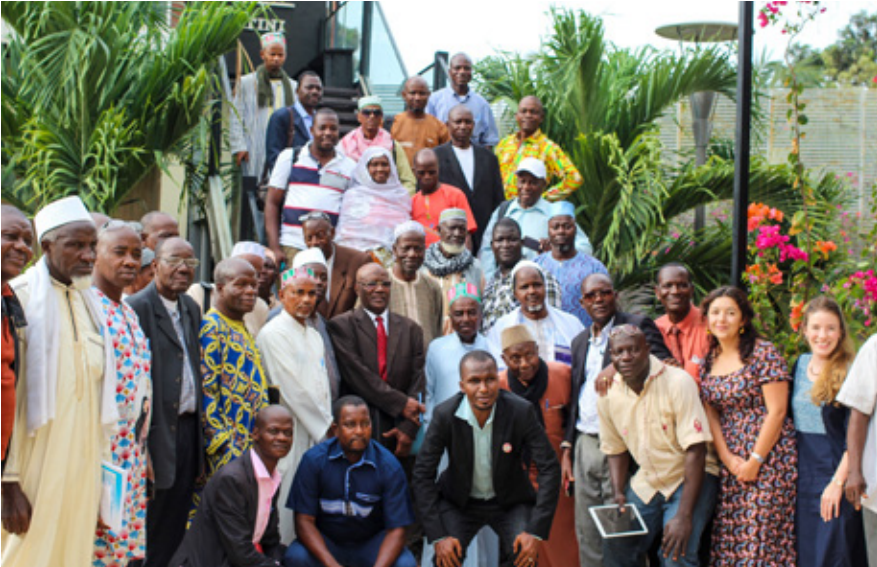
Religious leaders attending a capacity-building transitional justice and violence prevention workshop in Conakry in 2019.

implemented and the various ways in which these groups could engage with these mechanisms to prevent future violence and encourage social cohesion. In addition, while advocating for a cohesive and inclusive national reconciliation process, GIJTR has been supporting local CSOs and victims' associations to develop their own locally based initiatives to respond to victims' needs in their own communities.