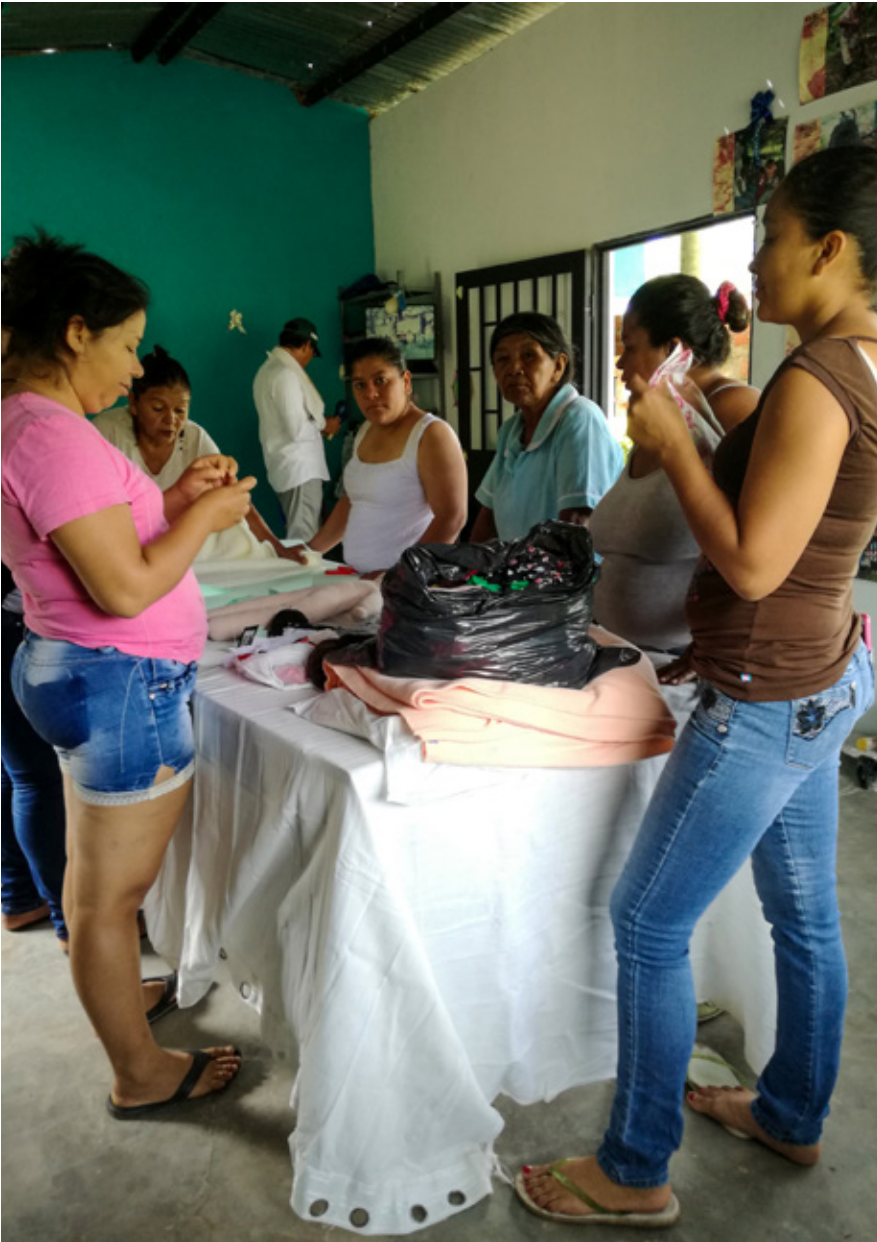
The Memory Committee of El Castillo sewing and creating dolls that share the stories of people who are disappeared.

institutions, can share information. Whilst such an approach poses potential security challenges for communities emerging from conflict, or still seeing conflict in their region, the project has shared numerous