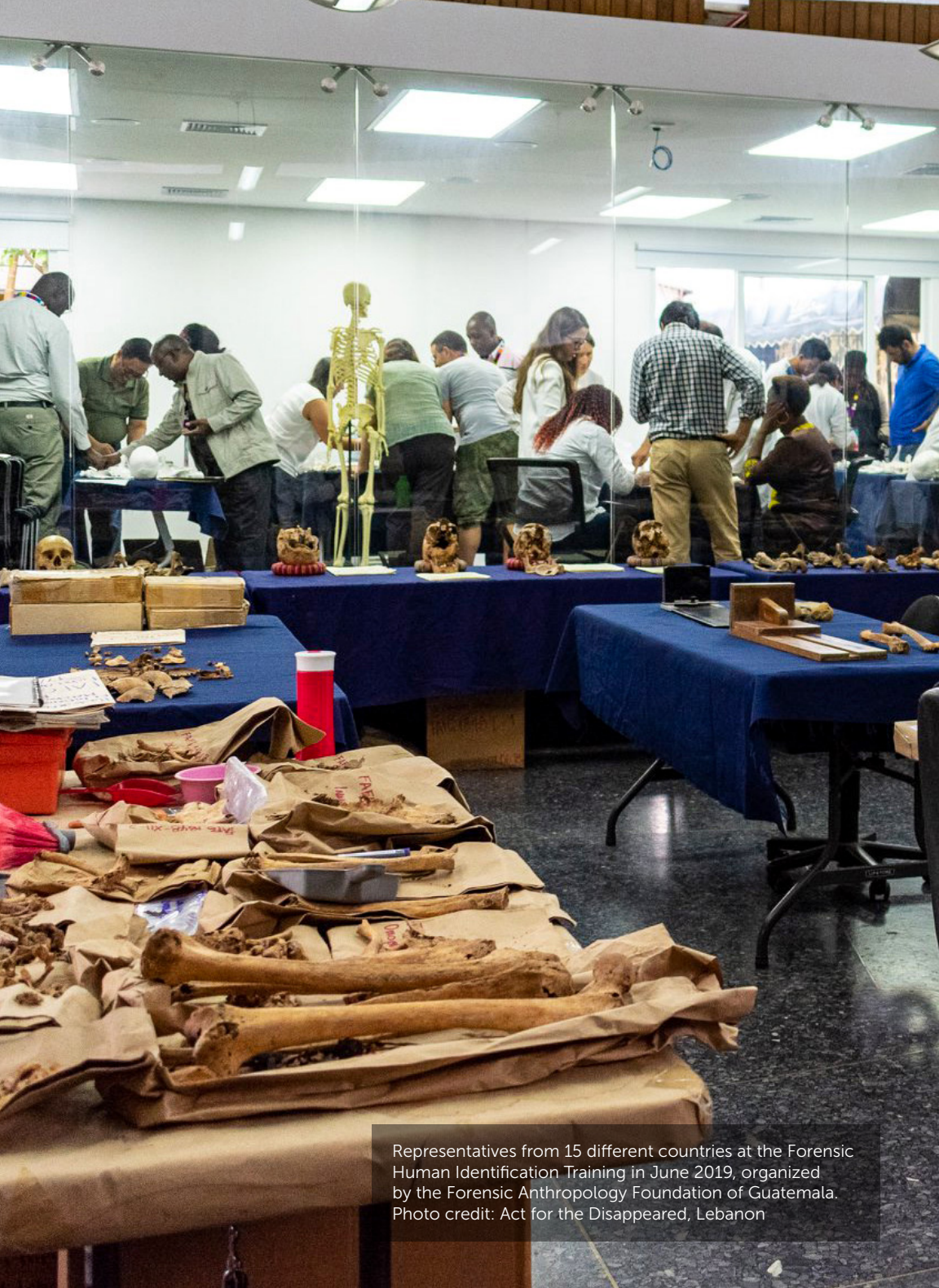
Representatives from 15 different countries at the Forensic Human Identification Training in June 2019, organized by the Forensic Anthropology Foundation of Guatemala.