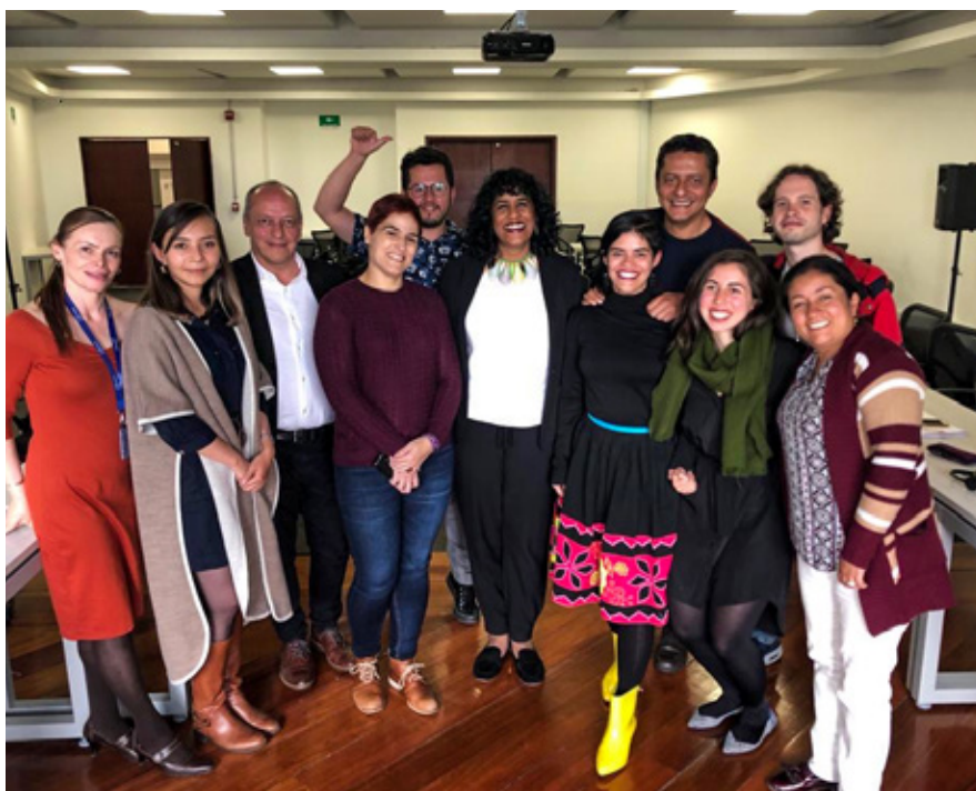
GIJTR partners meet with members of the Colombian National Commission for Truth and Transitional Justice to share and exchange community outreach strategies in Bogotá, in July 2019.

The community truth-telling initiatives implemented as part of the project played an important role in breaking a “code of silence” that had been imposed by the armed conflict and that communities had been unable to challenge, despite the change in context. One positive effect was that neighboring communities, having seen the impact of the actions, wanted to