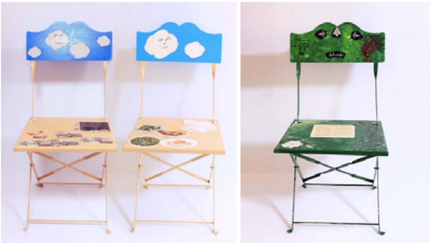
Empty Chairs Waiting Families , a memorialization project from ACT for the Disappeared and the International Committee of the Red Cross (ICRC). These chairs were designed and painted by brothers, sisters, mothers, fathers, wives, daughters, sons and even grandchildren of people who went missing in Lebanon during armed conflicts since 1975.

State action to address disappearance demands appropriate legal and institutional frameworks, and this is often the goal of CSO advocacy, including many participants in the pilot Forensic Academy. In Lebanon, for example, thirty years after the end of the civil war, CSOs (including ACT for the Disappeared, which took part in the Academy) have been lobbying for the creation of a national commission to investigate the fate of the missing, recover remains and make identifications. In November 2018 the Law for Missing and Forcibly Disappeared Persons in Lebanon was passed, 42 representing a significant step towards upholding victims' families' right to know. In the Philippines, Congress passed an "Anti-Enforced or Involuntary Disappearance Act" 43 in 2012, for which CSOs had lobbied for more than a decade. The Act mandates "Restitution and