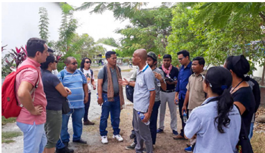
International Educators Workshop in Timor-Leste in June 2018.

In Guatemala, for example, one of the educators selected by the FAFG to attend the workshop was from the International Institute of Learning for Social Reconciliation (IIARS), which is a leading institution in education for social reconciliation in Guatemala. IIARS has an exhibition titled "Why We Are Like We Are", which presents the recent history of Guatemala and how this impacts its current society. They also lead the Technical Committee for Education for Peace, Historical Memory and Human Rights, which is creating a curriculum and teacher resources related to citizenship, human rights, historical memory and other topics, and which the Ministry of Education had started to implement in schools all over