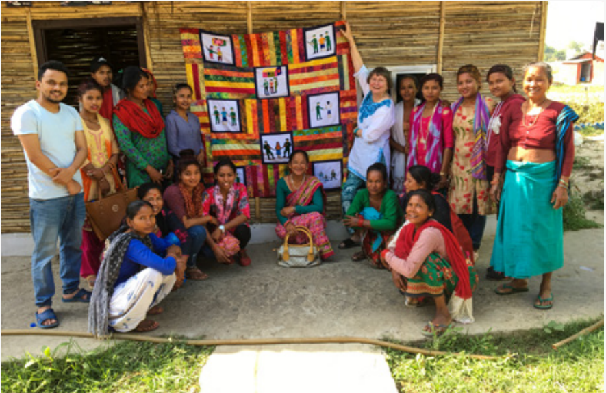
Memory quilt created by the families of disappeared in Bardiya, Nepal.

advocacy and may also have positive effects on an individual level. In addition, women often don't consider themselves victims unless they have been directly violated, but women's "secondary" violations as mothers, wives, sisters and daughters need to be brought to the fore to ensure that they can be addressed in a gender-appropriate way.