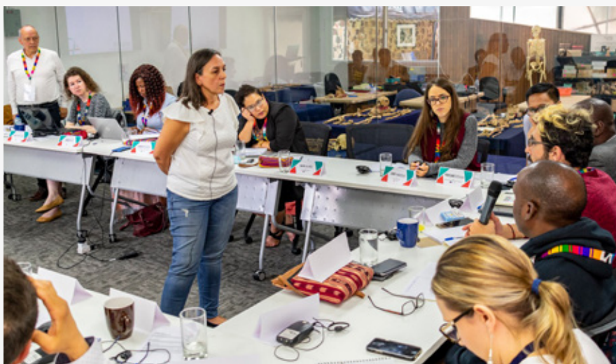
GIJTR participants share best practices related to enforced disappearances at a training in Guatemala.

A safe learning space was created during the training sessions, where vulnerability was encouraged in order for participants to learn from each other. The psychosocial training facilitated by CSVR sought to work on two levels: first, to equip participants with knowledge and strategies to better assist the families of the disappeared to cope with the impact of having an absent loved one, and second, to help participants themselves to cope with the impact of assisting people who have experienced deep trauma. The majority of participants had their own traumatic experiences and losses, and during the first few days, when highly emotive material was shared both visually and verbally by the participants, some participants experienced retraumatization. Therefore, during the psychosocial sessions, emphasis was placed on ‘containing’ the participants, i.e. supporting them to better regulate their emotions and teaching them simple self-care strategies. Daily exercises were conducted to identify their current internal state and then to assist them to relax through, for example, completing “feeling trees” (see Figure 1) connected to a “feeling forest”, or being guided through mindfulness meditations. During subsequent discussion, participants reflected on varied, complex emotional states through their feeling trees. In addition,