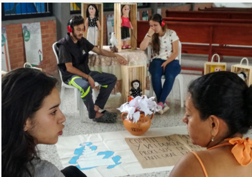
Visitors at a traveling exhibit in El Castillo listening to families' stories that were recorded through dolls to memorialize their disappeared loved ones.

The immersive approach of bringing participants to Guatemala, away from their everyday context, where they could focus more thoroughly on the training and the direct contact with specialists, offered the added benefit of strengthening collaboration between participating CSOs. They were able to share their views on the role of the Search Unit and how CSOs could support it both in its political role and in addressing the needs of families of the disappeared.