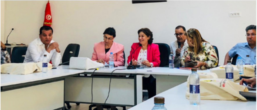
Participants in the MENA Transitional Justice Academy meeting with Commissioners from the Truth and Dignity Commission in Tunisia.

life imprisonment and, in some instances, forced to leave the country. The extent of the cases remains unknown, as victims fear reprisal and being further victimized and stigmatized in their families and communities.