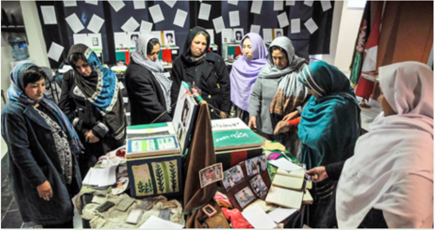
The Memory Box project documents personal narratives and stories of conflict in Afghanistan. These stories of loss as well as resilience create an avenue for dialogue and reconciliation among different ethnic groups in the war-torn country.

and is discussed further in Chapter 9. This constitutes the heart of a multifaceted evaluation system that uses outcome harvesting, external evaluation and peer evaluation – among other approaches – to provide a multidimensional view of program impacts that can feed a learning culture, as well as provide broader lessons.