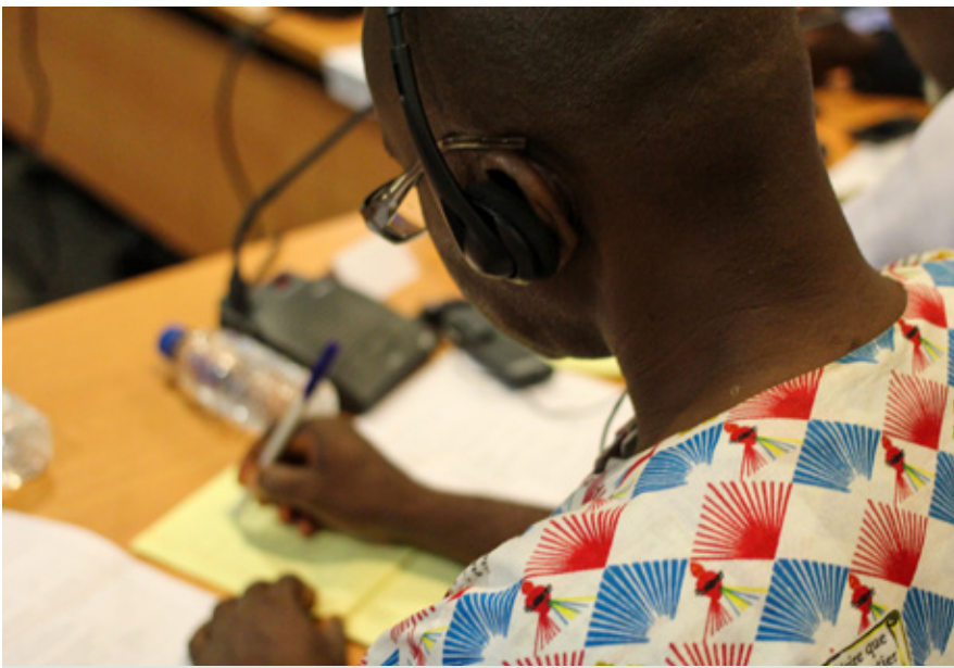
Reflections during a psychosocial support training with religious leaders in Conakry, Guinea.

Having some prior familiarity with oral history approaches, visual arts and advocacy made it easier for participants to conceptualize how to adapt those methodologies to serve transitional justice awareness-raising purposes in a participatory way. Some participants noted that while they were not clear on the first day of the training what facilitators meant by "participatory," after seeing and experiencing the presented methods over the course of the workshop, they understood how to alter their existing approaches to be less extractive and more elicitive, focused on building community trust and consensus. The training's emphasis on the process of designing and evaluating projects with community involvement, as opposed to achieving the project's expected results or deliverables, was novel to some participants, possibly as a result of working in a donor-driven environment. Facilitators emphasized the importance of