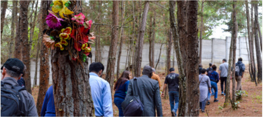
A visit to Comalapa memorial, as part of the Forensic Transitional Justice Academy in 2019 with Forensic Anthropology Foundation of Guatemala.

disappeared, particularly its reference that findings may not be used for criminal liability. Since the initial discussions related to the Truth, Justice, Reconciliation and Non-Recurrence Commission (TJRNRC), a truth commission, the mandate of the TJRNRC has been unclear and its relationship to the other mechanisms has remained undefined. The CTF recommended that the TJRNRC's goal should be to establish the truth about the conflict, highlight discriminatory practices and provide concrete, feasible recommendations for promoting truth and reconciliation. It also highlights that the TJRNRC's investigations and uncovering of the truth about events and incidents of discrimination – such as the burning of the Jaffna Public Library, the expulsion of Muslims from the Northern Province and the killing of policemen in the East – need to be included in the school history curriculum in order for youth to develop an understanding of the past and advance reconciliation and non-recurrence. Throughout the report, psychosocial support for victims of conflict is highlighted as a priority area, and women and youth are cited as key stakeholders, both as beneficiaries and implementers of the four proposed mechanisms.