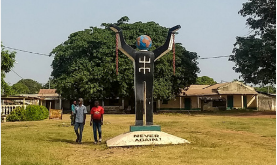
A statue that says "Never Again!" at the dock to depart for Kunta Kinteh Island in The Gambia looking towards the Island, referencing the history of enslaved people and the transatlantic slave trade.

others came from the legal, human rights, media, medical and mental health sectors.