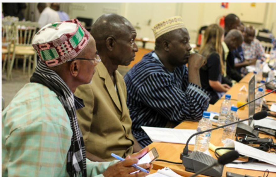
Religious leaders exchanging violence prevention and dialogue facilitation techniques, 2019.

All participants had previously worked on projects within their local communities, and many were survivors who conduct advocacy work as members of victims' associations. However, discussions demonstrated that prior to the training most attendees were not fully acquainted with participatory methodologies that emphasize the inclusion of all project stakeholders at every stage of the project, from conceptualization to evaluation. For example, some participants had experience in collecting oral histories of survivors and witnesses as a means of preserving their stories of human rights violations. However, during training sessions