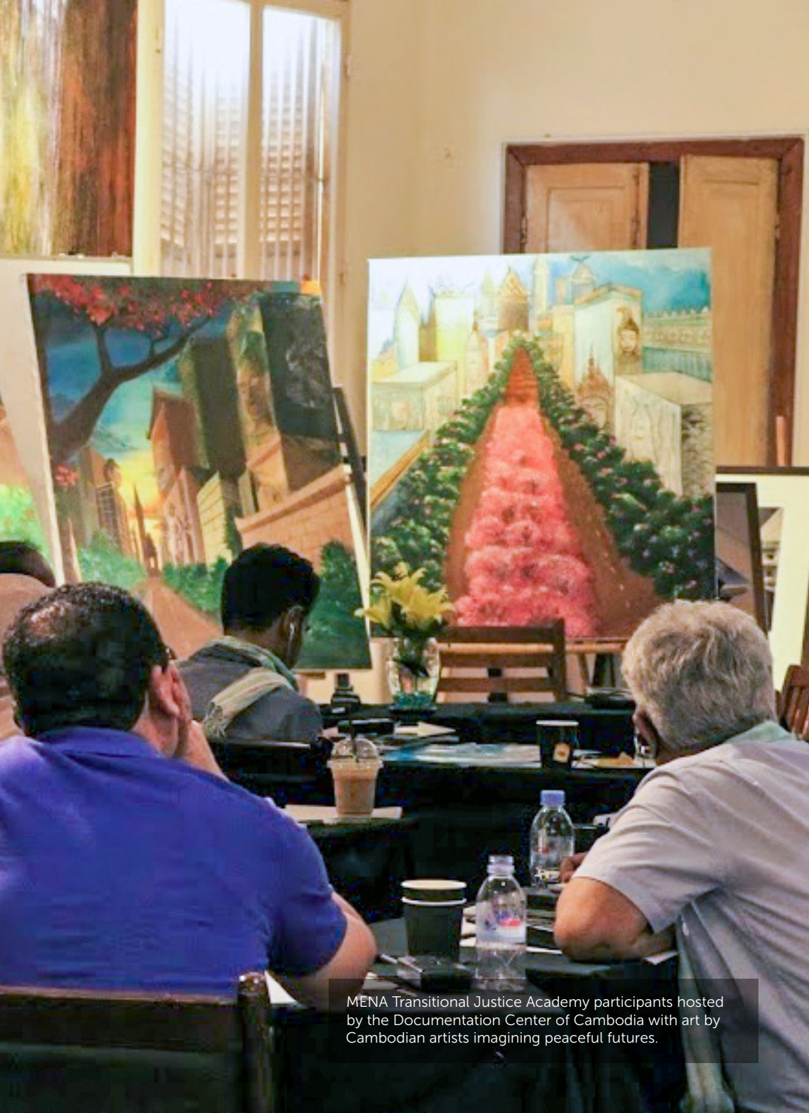
MENA Transitional Justice Academy participants hosted by the Documentation Center of Cambodia with art by Cambodian artists imagining peaceful futures.