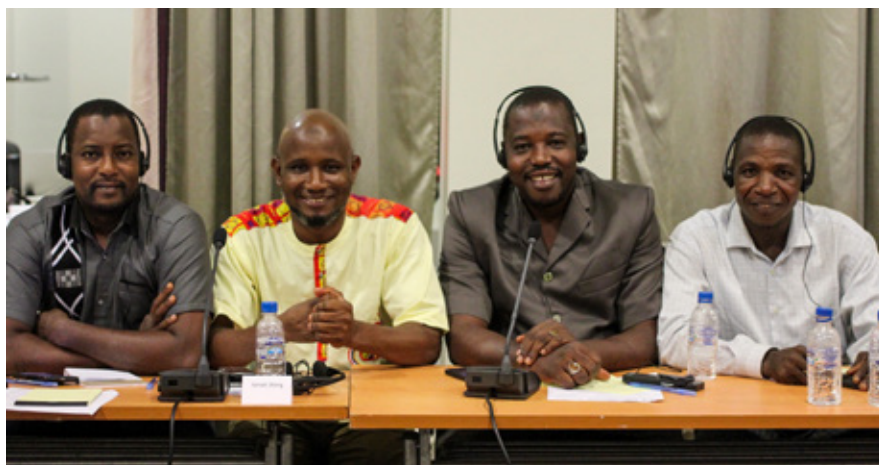
The regional coordinators collaborating and creating outreach strategies.

The first of the two workshops, which took place over four days, was focused on ensuring that the importance of psychosocial support within transitional justice processes would be understood by all of the participants, especially in a context where these services are in short supply and may not have been prioritized in the past. In recognition of the different levels of knowledge with which participants joined the workshop, GIJTR facilitators aimed to present basic concepts related to working with trauma for participants with little to no prior knowledge