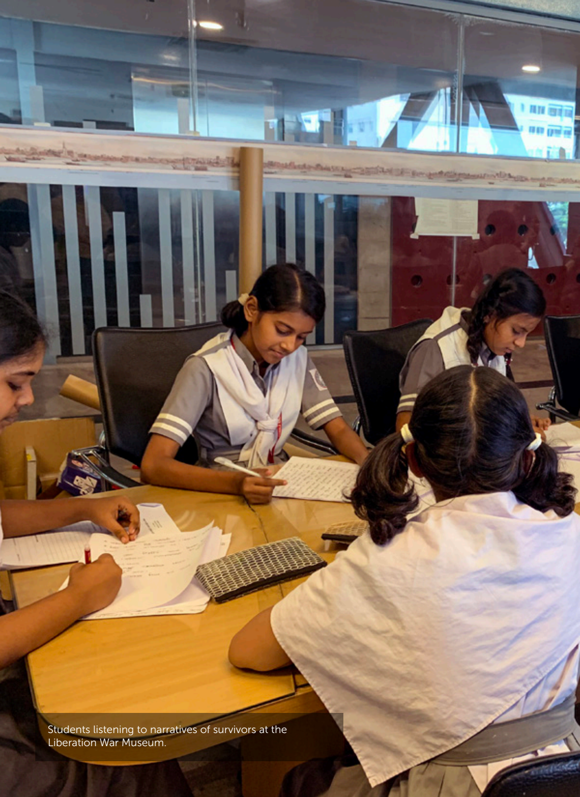
Students listening to narratives of survivors at the Liberation War Museum.