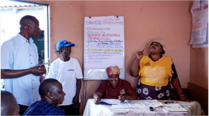
GIJTR Exchange between Guinean civil society and South African civil society in 2019.