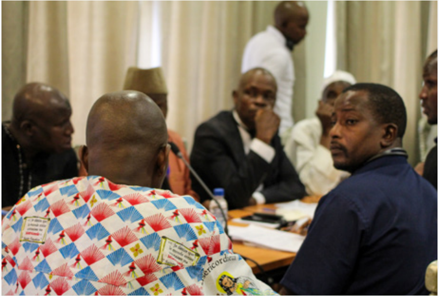
Regional coordinators and religious leaders discuss and plan activities, 2019.

participants to contain and process these responses, rather than continuing with the previously prepared content. Though unexpected, this was a profound moment that required the facilitators to be respectful and mindful of the participants' pain and loss and, the facilitators recognized, would affect the participants' trust and commitment moving forward in the project.