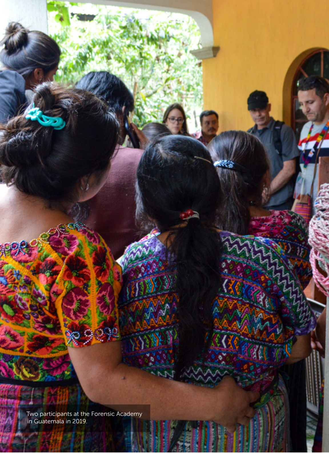
Two participants at the Forensic Academy in Guatemala in 2019.