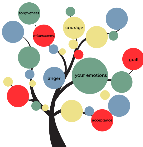
Figure 1. Feeling Tree