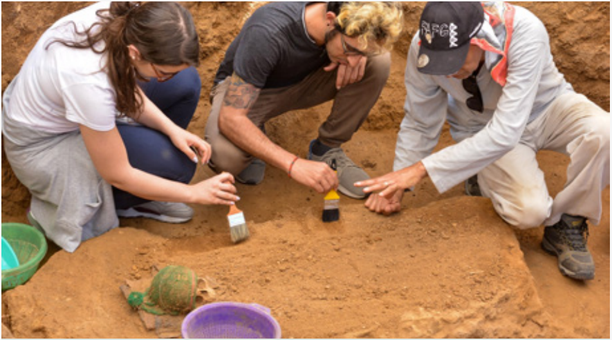
Archaeologists exhume human remains in Guatemala.