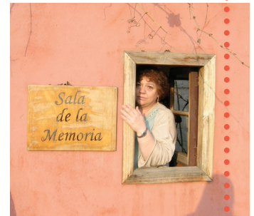
Villa Grimaldi Peace Park, Chile