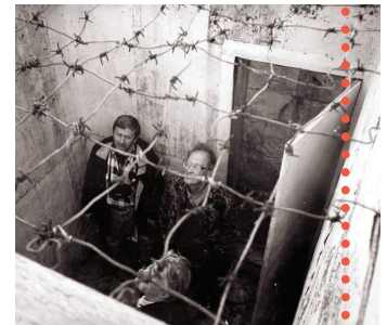
Gulag Museum at Perm-36, Russia