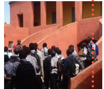
Maison des Esclaves, Senegal